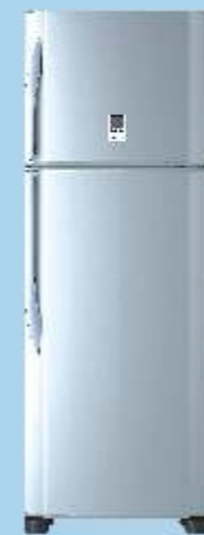
SJ-TK53R (472 litres) 700(W) x 1670(H) x 720(D) mm

Hybrid Cooling System: The rear aluminum panel inside is cooled to approx. 0° C, and highly humid chilled air is spread throughout the compartment, which prevents excessive dryness, uneven cooling and over cooling there by keeping the food fresh.