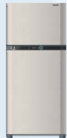
SJ-PT61R (555 litres) 800(W) x 1670(H) x 720(D) mm