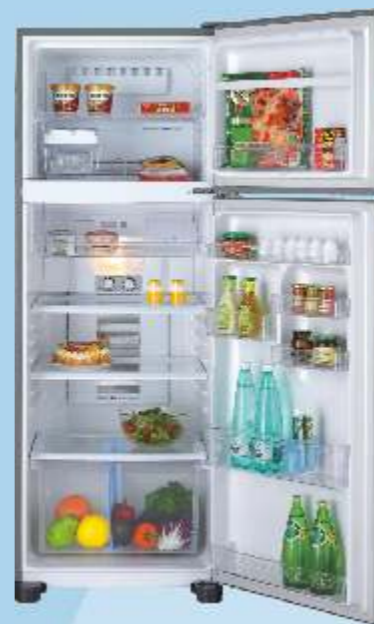
SJ-TK66R (596 litres) 800(W) x 1770(H) x 720(D) mm