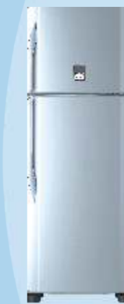
SJ-TK45R (400 litres) 645(W) x 1670(H) x 680(D) mm