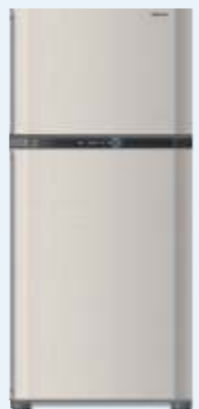
SJ-PT53R (472 litres) 700(W) x 1670(H) x 720(D) mm