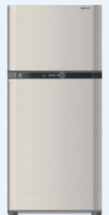
SJ-PT57R (508 litres) 700(W) x 1770(H) x 720(D) mm