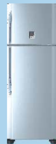
SJ-TK49R (431 litres) 645(W) x 1770(H) x 680(D) mm