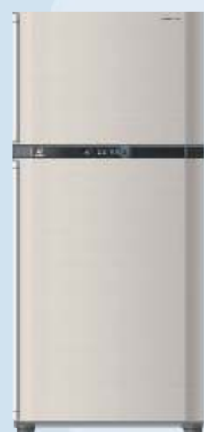
SJ-PT66R (596 litres) 800(W) x 1770(H) x 720(D) mm