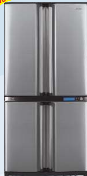
SJ-F78SP (625 litres) 890(W) x 1830(H) x 770(D) mm with advanced Plasmacluster & advanced Hybrid Cooling System