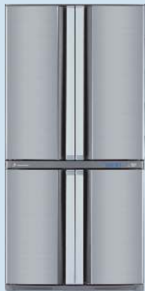
SJ-F75PE (625 litres) 890(W) x 1830(H) x 770(D) mm